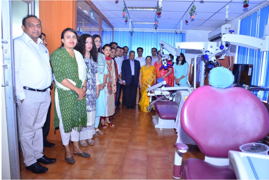
Faculty members of the Department of Conservative Dentistry & Endodontics at the Inaugural session of the Zeiss Extaro 300.