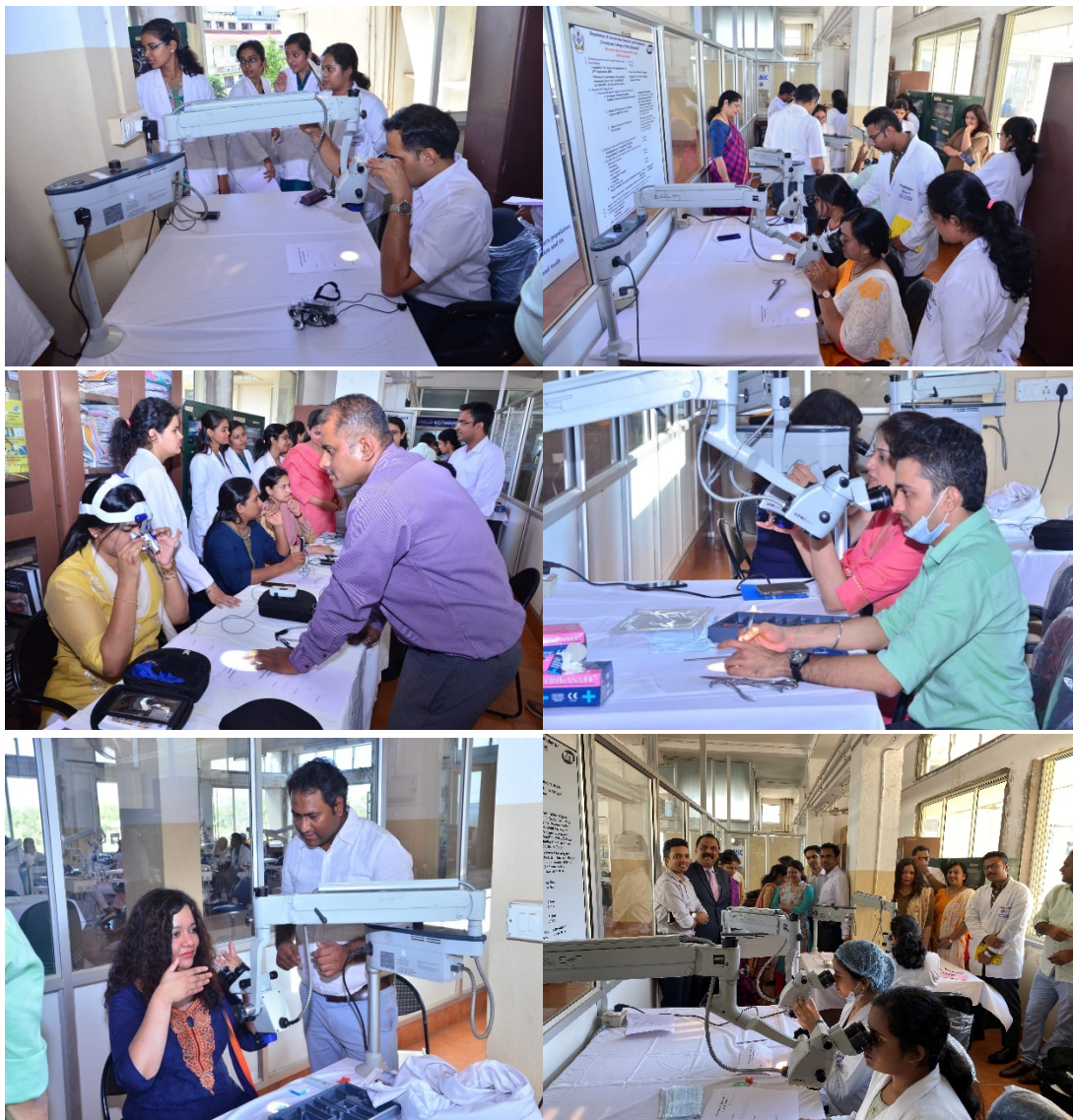
Demonstration and Hands on session on Zeiss Loupes and Table Top Microscopes.