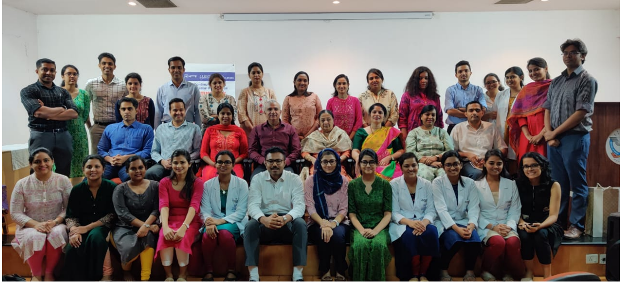
Faculty members and postgraduate students at the valedictory program.