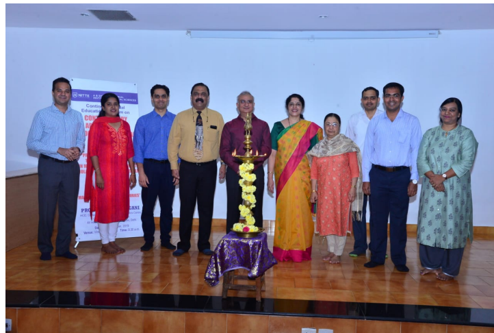
Inauguration of the Lecture sessions by lighting the lamp

16 faculty members and 20 postgraduate students participated in the program.